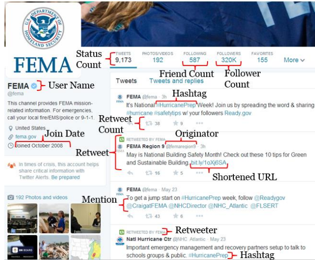
Figure 2: This Twitter profile belongs to the Federal Emergency Management Agency captured May 23, 2014. This shows actual tweet activity of the FEMA [8]